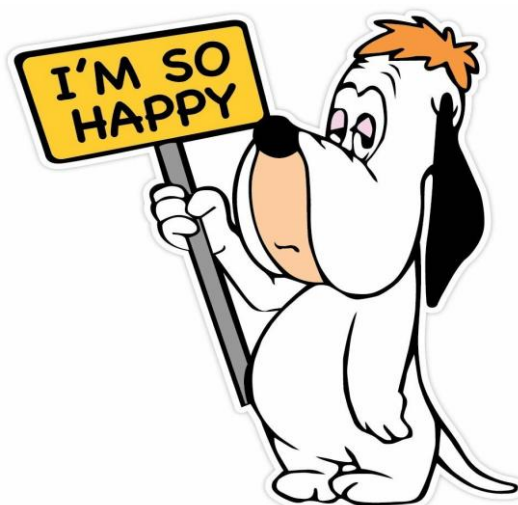
Fig. 1 – Droopy Dog with its iconic quote.

Manuscript received on 26 March 2021 | Revised Manuscript received on 30 March 2021 | Manuscript Accepted on 15 April 2021 | Manuscript published on 30 April 2021.