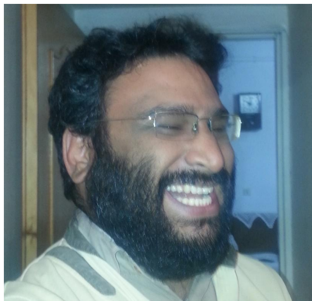
Fig. 3 - My photo with beard.

Currently I have no religion. Now I have a long beard and my photos are present at my FACEBOOK page [38] and are in access in Google search engine Image section. It is also available in Fig. 3.